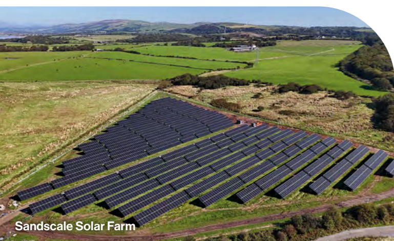
Sandscale Solar Farm

Westmorland and Furness offers an unrivalled opportunity to be the place for green investment in the North, set in a world-renowned location with an enviable lifestyle and with a progressive, forward-thinking and ambitious public sector partner.