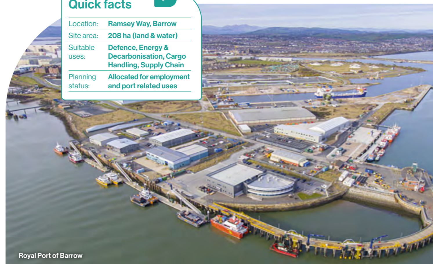
Royal Port of Barrow