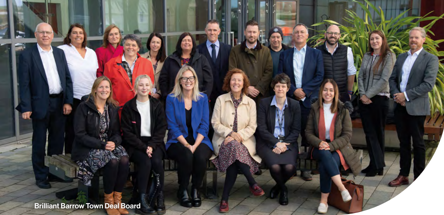
Brilliant Barrow Town Deal Board